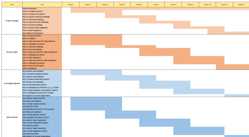
Figure: Project Gantt with Deliverables